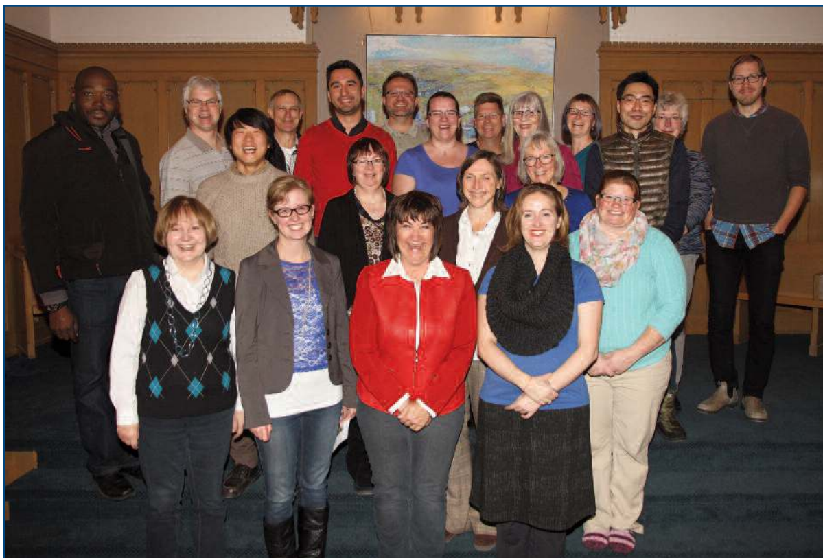
Students gathered in St. Andrew's College Chapel

In this season of Advent as we wait for God among us... we wish all your days are filled with joy and cheer!